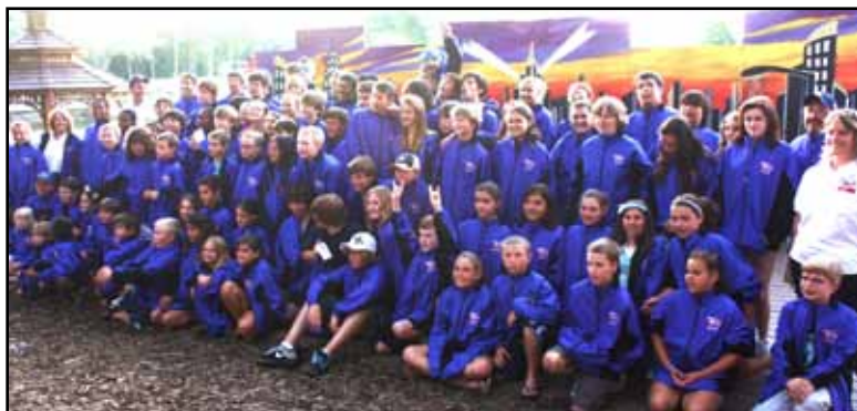
"Old Timer's Club" Inductees

...Gold Rush? COLOR WAR?? WE'RE NOT TELLING!!!